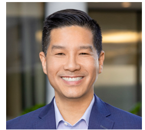
Tam T. Nguyen Advance Beauty College