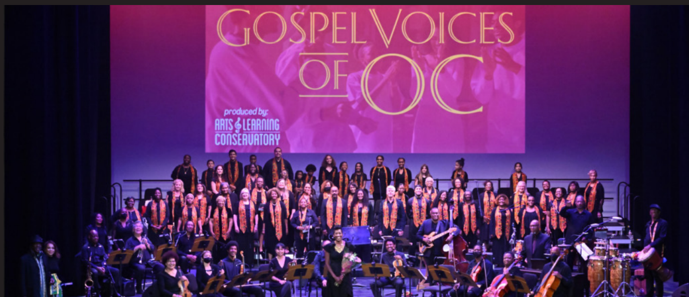
Arts & Learning Conservatory