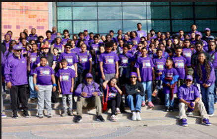
Bridge Builders LA