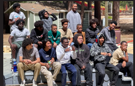
Need 4 Bridges