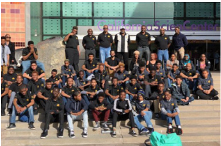
100 Black Men of Orange County

Grantee organizations have served approximately 33,000 individuals in many capacities thanks to support from this fund.