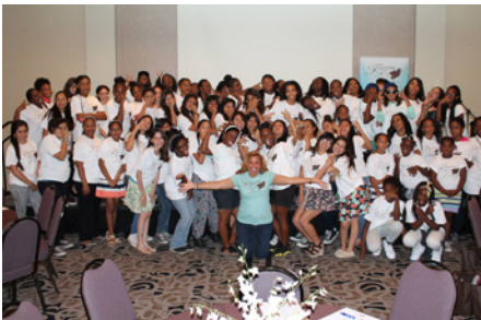
Forgiving For Living, Inc.

Thanks to 163 generous contributions from 128 individual donors, this fund has continued to grow since its inception in 2020.