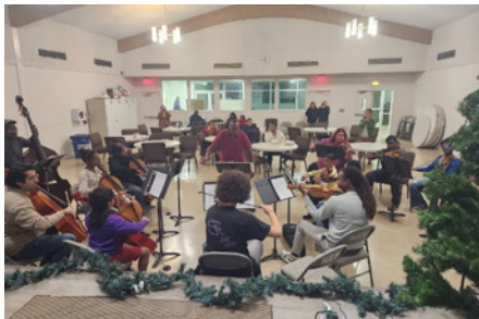
New Hope Presbyterian Church Orchestra

More than $1 million has been granted to 81 nonprofit organizations, locally, nationally, and around the world.