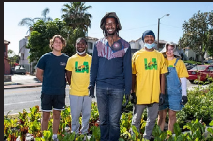
Crop Swap LA