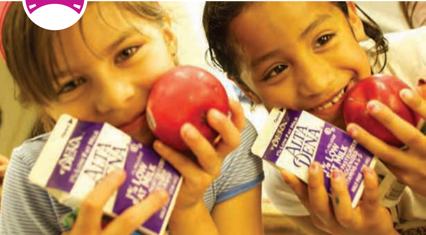
▲ Second Harvest Food Bank of Orange County