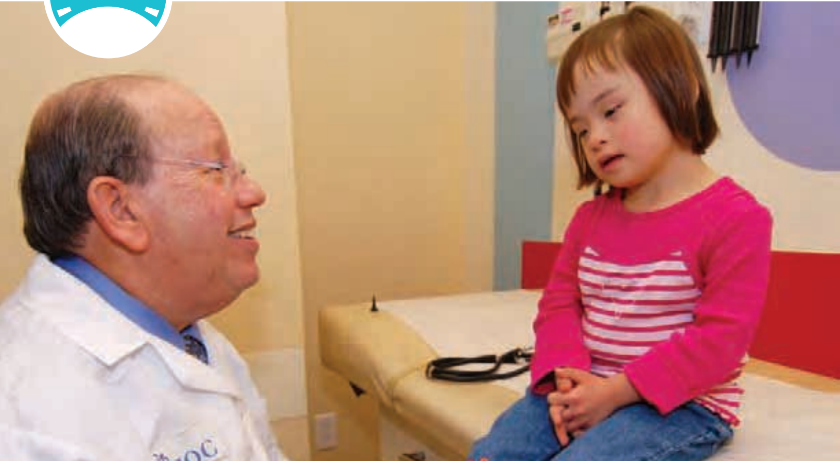
▲ CHOC Children's Down Syndrome Program