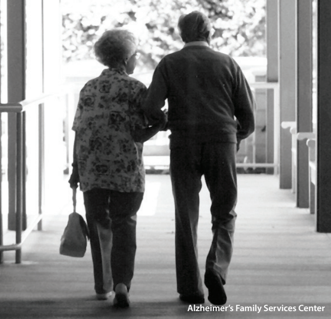
Alzheimer's Family Services Center